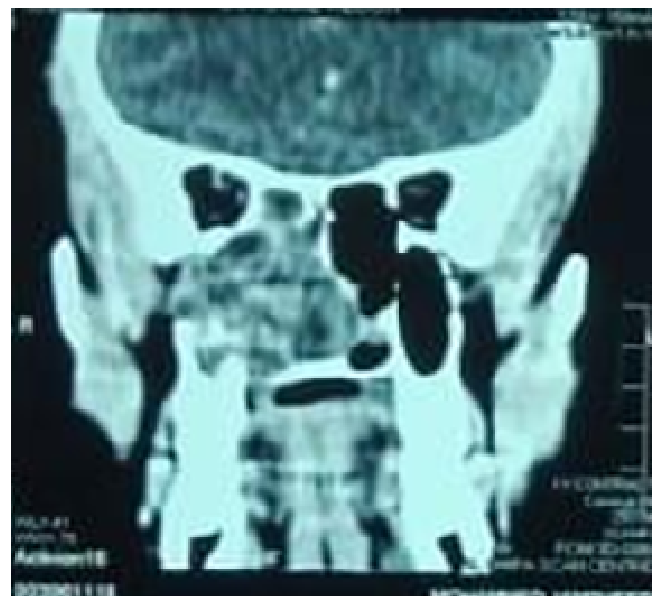
Fig 1. CT scan showing extensive bone destruction in a patient with adenoid cystic carcinoma of maxillary sinus (Rt)

The contrast enhanced CT scan findings revealed sinus opacity with bony erosions and destruction resulting in early involvement of adjacent structures like the orbit and or skull base in malignancies of the nose and paranasal sinuses. (Fig 1) The benign lesions like mucoceles (Fig 2) and fibro-osseous diseases (Fig 3) did reveal bony expansion and thinning with extension to adjacent structures mimicking malignancy.