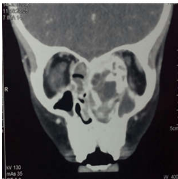
Fig 3: CT scan in a patient with fibrous dysplasia showing expansile lesion with orbital extension

The MRI of orbit and brain did help to ascertain the extent of the disease prior to treatment. Though challenging in children, our 3 year old patient with aneurysmal bone cyst had an MRI which revealed intracranial extension dictating a combined approach for complete excision (Fig 4) The radiological investigations though important in diagnosis had grey areas where a few benign lesions could mimic a malignancy and malignant lesions in early stages could be mistaken for a benign condition.