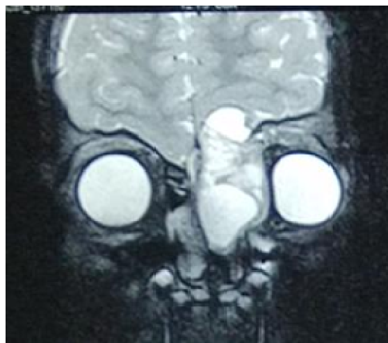
Fig 4. MRI in our patient with aneurysmal bone cyst showing multilocular cystic lesion with both intracranial and orbital extension

Our patient with meningioma had the contrast enhanced CT scan showing erosion of the greater wing of sphenoid with lesion extending to the paracavernous region and anterior part of middle cranial fossa.(Fig 5)The MRI showed a T2 hyperintense mass lesion involving the retro orbital intraconal compartment displacing the optic nerve inferomedially, inseparable from the extra ocular muscles at the orbital apex (Fig 6) Though radiologically suggestive of a lymphoproliferative lesion it was the biopsy that helped clinch the diagnosis of meningioma enabling treatment.