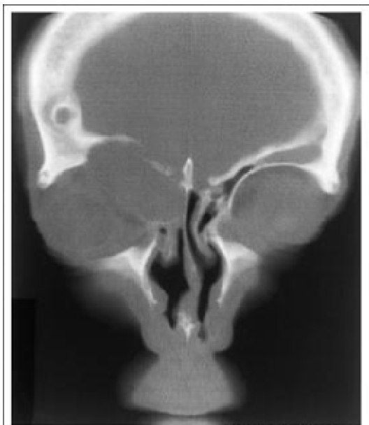
Fig 2. CT scan in a patient with frontoethmoid mucocoele showing expansile lesion in right frontal sinus with bony erosion of the floor of the frontal sinus