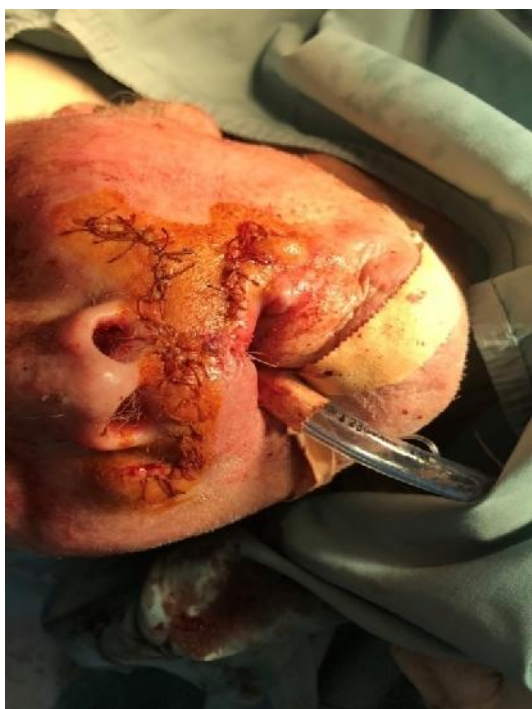
Figure 3. After suturing during intervention