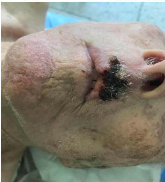
Figure 1. Cancer before treatment