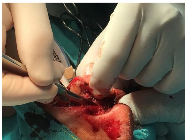
Figure 2. Lower lip resection and formation removal