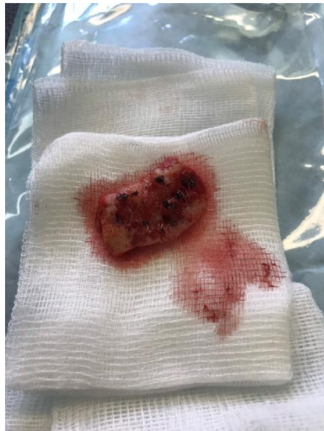
Figure 4. Tumor removal

Therapy: Cefotaxime 1,0 2 1; Fraxiparine 0,4 1 1; Tramalgin 2 1. The scheduled treatment was for 7 days.