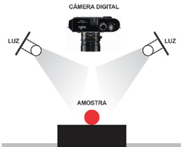
Figure 1. Layout of the digital image acquisition system of tomato fruits ( Solanum lycopersicum )

Color image analysis: Fruits were photographed by digital camera (Samsung WB1000, Manaus, Brazil) with 12.2 megapixel resolution. Tomatoes were placed on a black surface, and digital images were taken immediately after harvest and preparation samples under controlled lighting of two electronic lamps (Philips, white color, 20W), arranged at an inclination angle of 45^\circ , and D65 illuminant (Silva, 2006). Camera lens was positioned at an angle perpendicular to the fruit surface and distance of 40cm from the black surface (Figure 1).