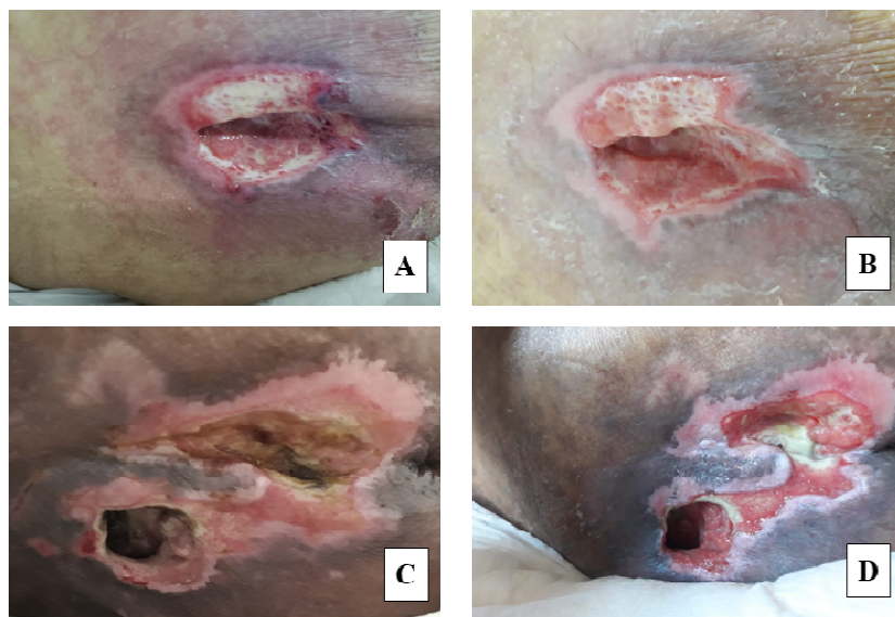
Figure 1. Sacral lesion, treated on days 0 (A) and 14 (B) with Aloe vera and treated on days 0 (C) and 14 (D) with KOLAGENASE ® .